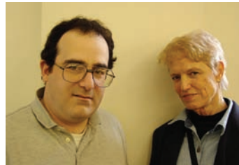
Rainbow Center Speakers